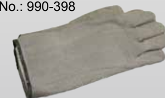
Protection gloves Art.-No.: 990-398